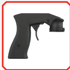
Economy Spray Grip #243546

Ergonomic design provides maximum comfort