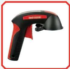
Comfort Grip #241526

Ergonomic design provides maximum comfort