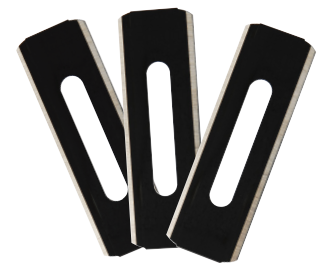
(3 blades included)