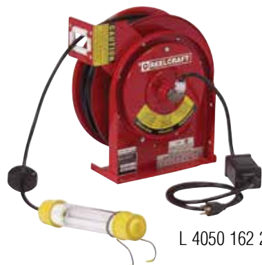
L 4050 162 2