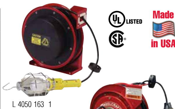
L 4050 163 1