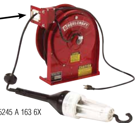
L 5245 A 163 6X