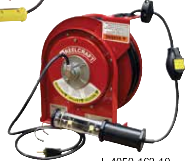
L 4050 163 10

For indoor non-weather tight applications only. *Incandescent bulb 75 watt max. Series L4000 and L5000 models UL listed at 125 Volt 60 HZ single phase. **Models equipped with automatic on/off switch that activates power. NOTE: Swing brackets should be used if cords are pulled at more than 45°. Reference page 4 for guide arm positions.