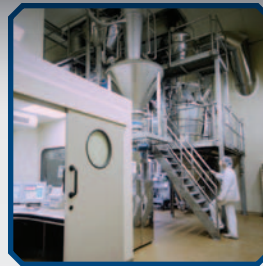
Food and pharmaceutical