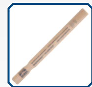
Stir Stick #251398