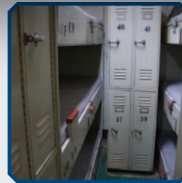
Occupied and confined spaces