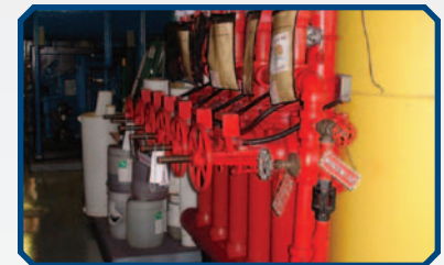
Equipment and more