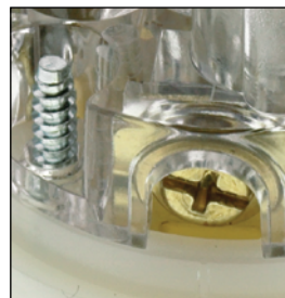
Captive terminal screws eliminate nuisance dropping and searching for missing screws.