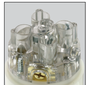
Deep-funnelled, large wire wells guide conductors into termination position.