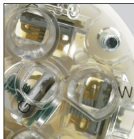
Wire clamps move within individual chambers to provide positive clamp lock without cutting wire strands.