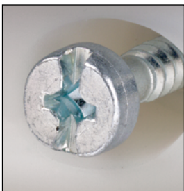
Shrouded pockets in cord clamp prevents slippage of screwdriver blade when tightening clamp screws.