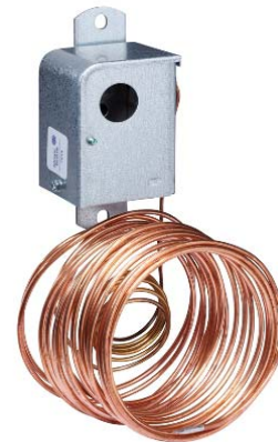
Figure 1: A11 Series Low Temperature Cutout Control

A11 Series low temperature cutout controls are available with Single-Pull, Single-Throw (SPST) or Single-Pull, Double-Throw (SPDT) contact action. Typical applications include the sensing of low temperature conditions to avoid over cooling or icing of hydronic coils, cooling coils, and liquid-handing pipes. The controls are compact and sturdy, and have an adjustable temperature setpoint range with a fixed differential. The range adjustment screw is accessible at the bottom of the control, and at the top of the control when the cover is removed.