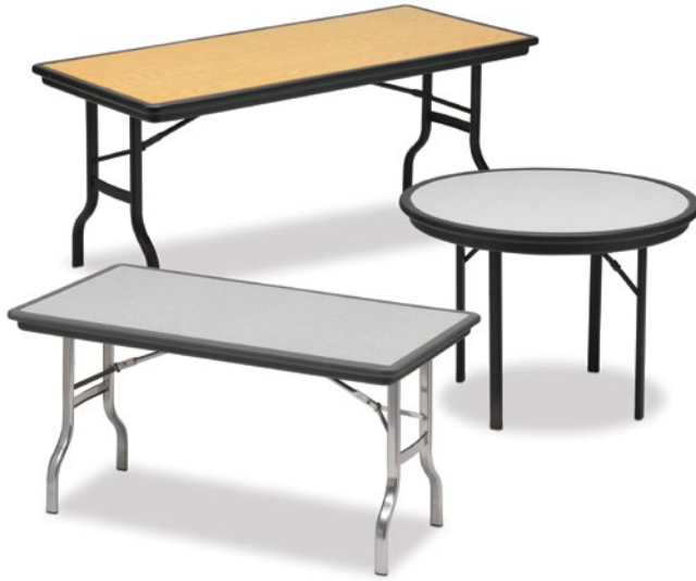
Upper Left: 30" x 72" Table, Black Top Black Legs with Oak Inlay Lower Left: 30" x 60" Table, Charcoal Top Chrome Legs with Granite Inlay Middle Right: 42" Round Table, Black Top Black Legs with Granite Inlay

The ultimate in durability, design and function, IndestrucTables™ are ideal for use in offices, banquets or any temporary work environment. This professional looking, lightweight folding table has many unique features and finishes and will last for many years – and still look as good as new!