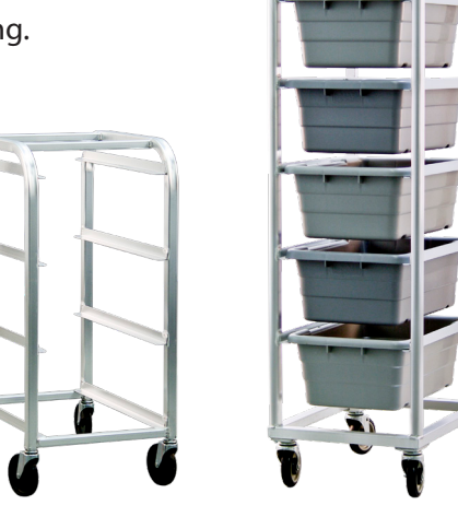
59YF46 - 6-Lug Dolly