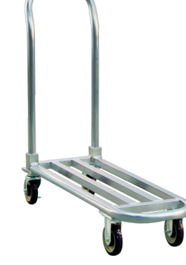
12G970 - Platform Truck 1184 Removable Handle