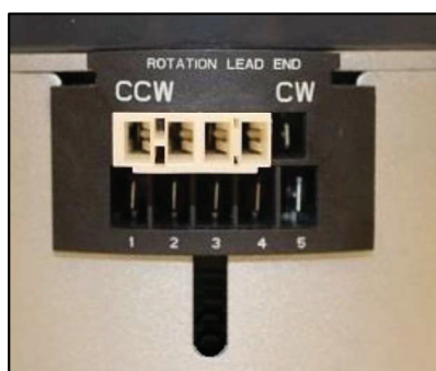
Counter Clockwise Rotation

SOLID LINES ARE SHOWN FOR CCWLE ROTATION. FOR CWLE ROTATION, CHANGE THE CONNECTOR ORIENTATION TO DASHED LINE.