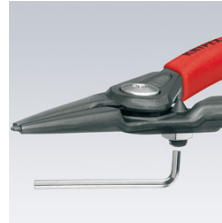
Style 3 / Style 4: with adjustable opening restriction