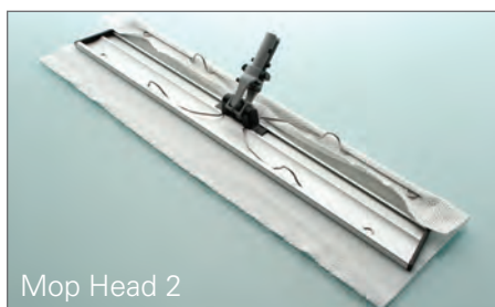
Mop Head 2

Berkshire's Flat Mop Head is light and easy to maneuver, even with wet wipers attached. The stainless steel springs or plastic eyes hold multiple mop wipers in place and are very easy to operate. The bottom of the mop is smooth and has no lines or grooves where bacteria or other contamination can settle.