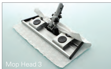
Mop Head 3