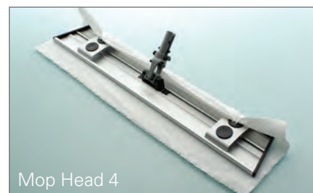
Mop Head 4