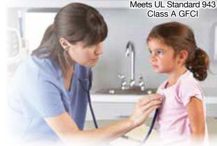
Meets UL Standard 943 Class A GFCI