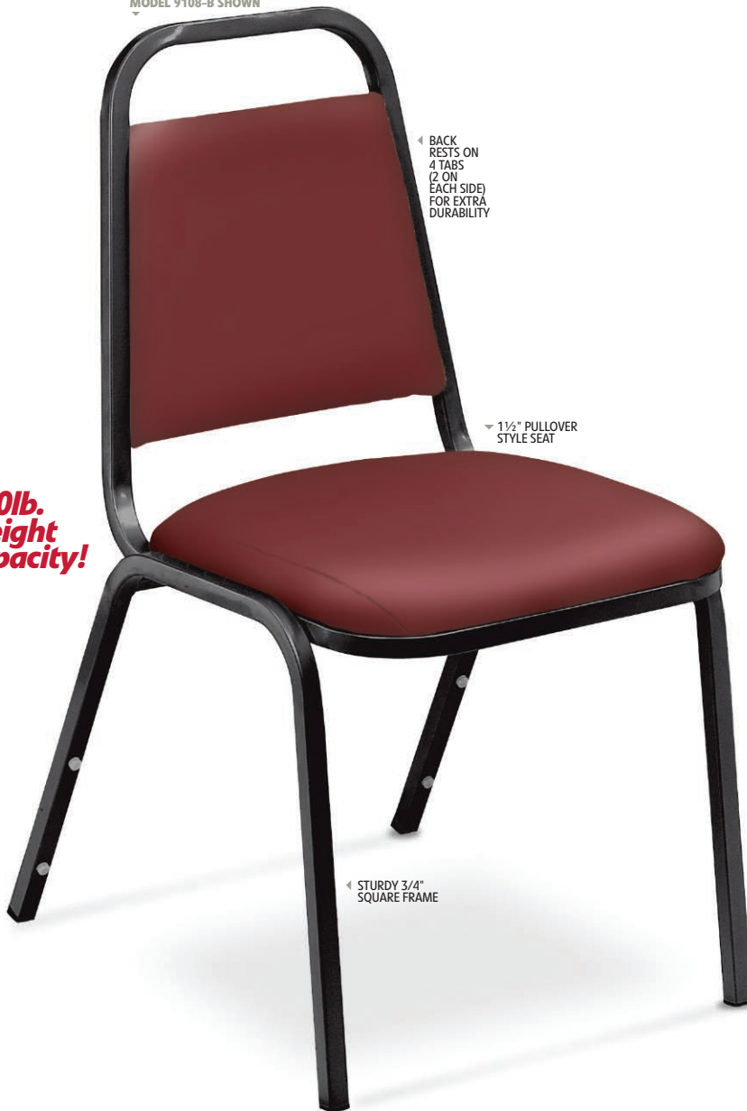
MODEL 9108-B SHOWN

products meet or exceed applicable ANSI/BIFMA standards