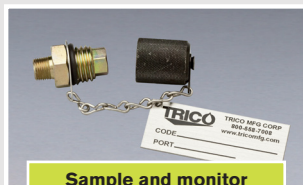
Sample and monitor fluids without shutdown