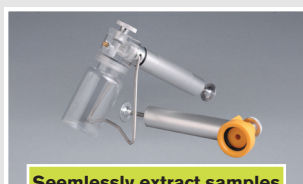
Seamlessly extract samples from the sample port

Liquid Level Gauge Sample Ports offer the same sample benefits as pitot tubes however they provide easy viewing of the fluid level and condition. They are ideal for bearing housings and other non-pressurized applications.