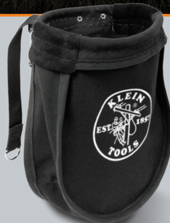
Nut & Bolt Pouch