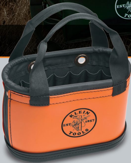
Hard Body Oval Bucket (With leather skinning knife sheath)