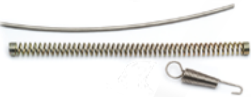
HARD MATERIALS Spring steel and piano wire