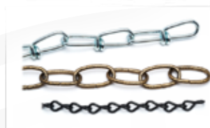
CHAIN Light duty, hobby, and craft chain