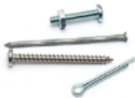
FASTENERS Bolts, nails, rivets, and screws