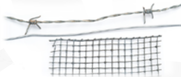
FENCING Barbed wire, chicken wire, hardware cloth