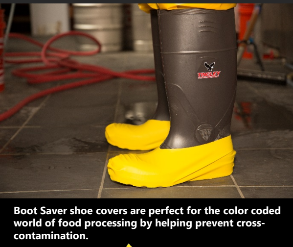
Boot Saver shoe covers are perfect for the color coded world of food processing by helping prevent cross-contamination.