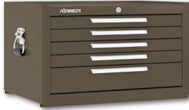
2805X 5-DRAWER TOP CHEST