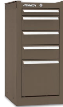
205X 5-DRAWER SIDE CABINET