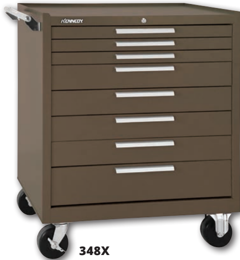
348X 8-DRAWER CABINET