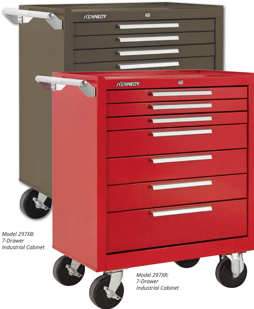
Model 297XB: 7-Drawer Industrial Cabinet

The K2000 is 20" in depth and ready to handle all your day to day needs. Durability comes standard so you get demanding jobs done time and time again.