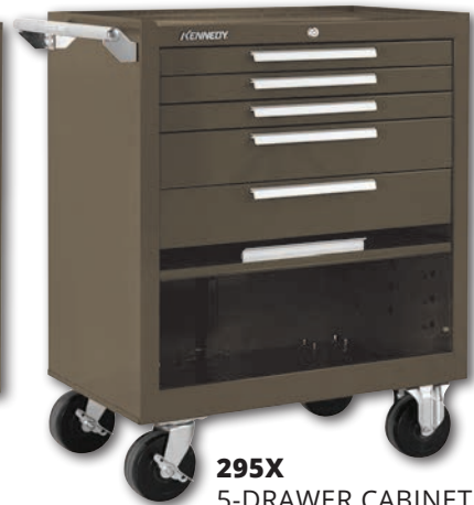
295X 5-DRAWER CABINET