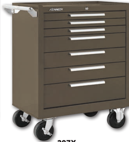
297X 7-DRAWER CABINET