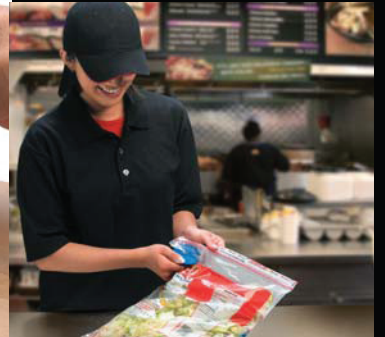
Cut For Resealing