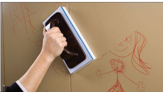
Designed for use with 3M™ Doodlebug™ Handblock Pad Holder No. 6473