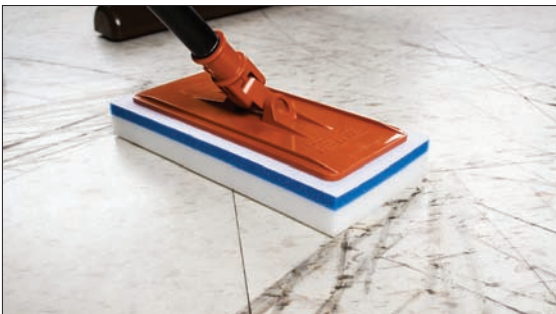
Designed for use with 3M™ Doodlebug™ Pad Holder No. 6472