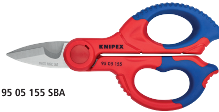
95 05 155 SBA

With crimp area for end sleeves (ferrules) up to 6.0 mm 2