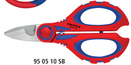
95 05 10 SB

WARNING: This product can expose you to chemicals including lead, which is known to the State of California to cause cancer. For more information go to www.P65Warnings.ca.gov