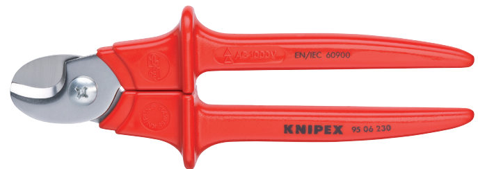
95 06 230 ⚡ 1000V ⚡ ⚡ ⚡ ⚡